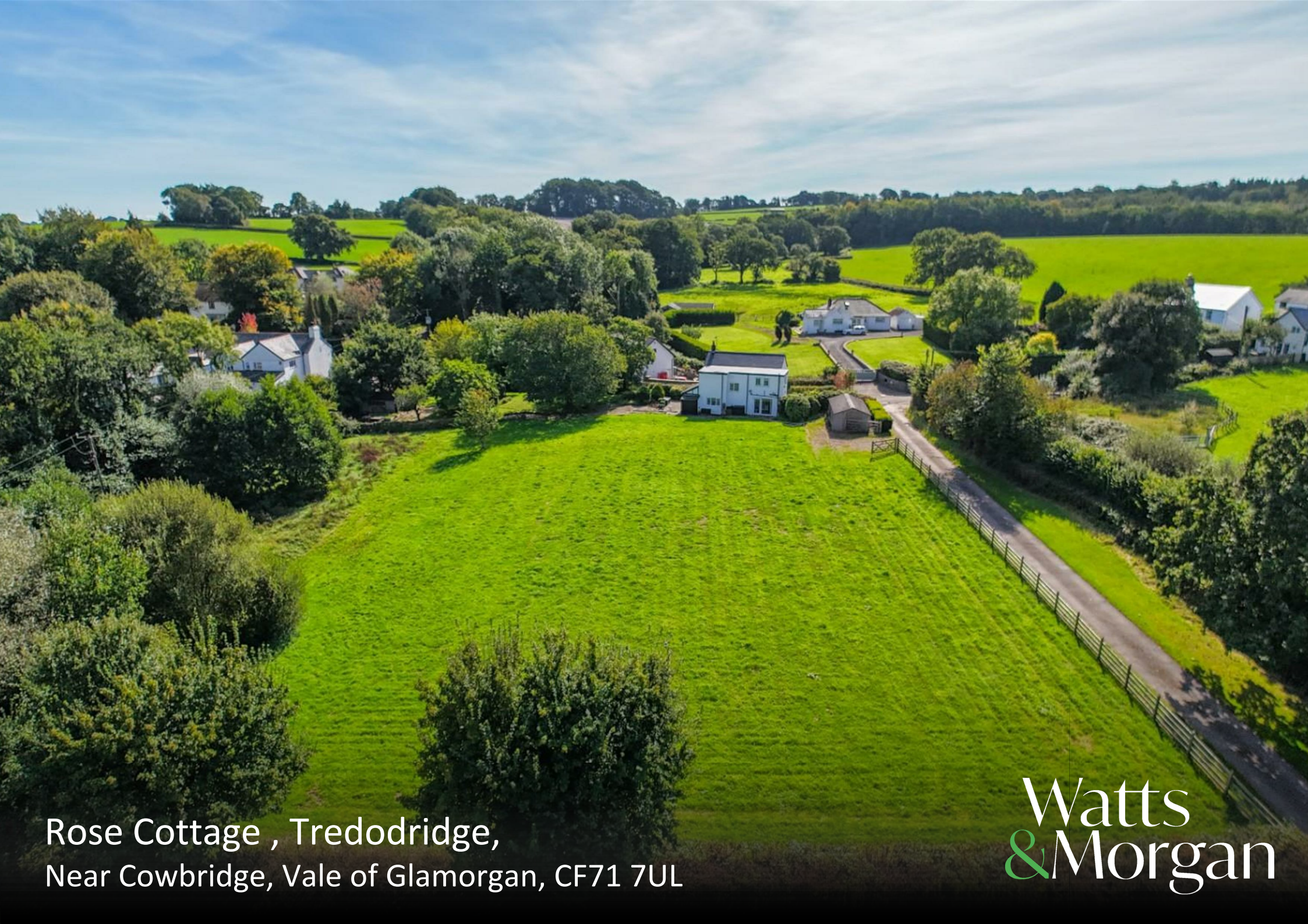
Rose Cottage , Tredodridge, Near Cowbridge, Vale of Glamorgan, CF71 7UL